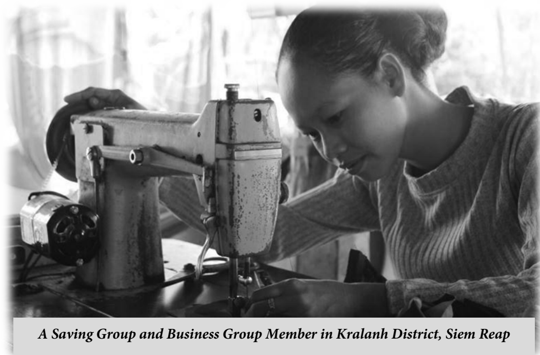
A Saving Group and Business Group Member in Kralanh District, Siem Reap

Office: #42F, Str. 488, Psar Doeum Thkov, Chamkarmon, Phnom Penh Contact: 023 997 967, Email: cwcc@cwcc.org.kh , Website: www.cwcc.org.kh